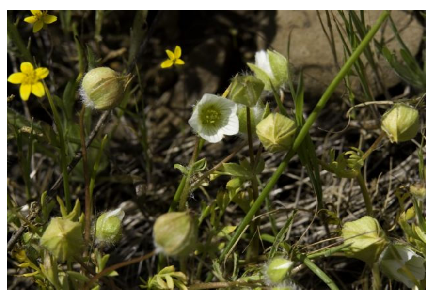
Large-flowered woolly meadowfoam (Limnanthes floccosa ssp. grandiflora), a federally-listed endangered species.

In Oregon, the Conservancy owns or manages 48 nature preserves and has helped protect over 492,000 acres of important habitats, with support from 22,000 member households. Learn more at nature.org/Oregon