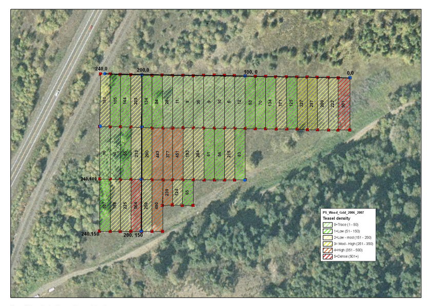
Teasel Density in 10 m x 50 m grid cells Popcorn Swale Preserve 07/20/2007 EH, LH,MS, Volunteers